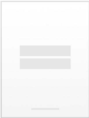
A First Introduction to Quantum Computing and Information Zygelman, B. (2018)